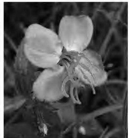
Figure 5. Virginia meadow-beauty ( Rhexia virginica ) at the South Fork Natural History.

The morning of 21 July greeted us with sunny skies, a perfect day for exploring the South Fork. First on the agenda was the South Fork Natural History Museum at Bridgehampton, Southampton Township. The pond located east of the museum building was surrounded by a sea of yellow, thanks to a dense colony of creeping St. Johnswort, a very rare species in New York State, in peak bloom. Interspersed among these plants were many showy blooms of Virginia meadow-beauty (Figure 5) and hyssop hedgenettle, as well as a few swamp milkweeds. As if overwhelmed by this extravaganza of floral fireworks, both of the viewfinders on my camera abruptly stopped working. My camera had temporarily protested high humidity conditions before, e.g., during a recent trip to Cancun, Mexico that had permanently taken out one of the viewfinders, but now I had none, undoubtedly due to taking too many risks at Sandy Pond and testimony to the incompatibility of electronics and water. For the rest of the trip, I continued to point and shoot